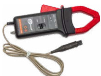
C-5A current clamp (Φ=39 mm) 1000 A AC/DC