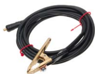
Current carrying test lead 6 m / 10 m / 15 m black I2 (200 A, 25 mm 2 )

WAPRZ006BUBBU1 WAPRZ010BUBBU1 WAPRZ015BUBBU1