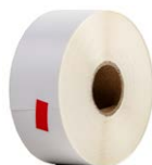
Label roll - black on white for D2 printer (SATO)