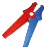
2x Kelvin clamp, 1 kV, 25 A