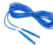
Test lead 6 m / 10 m / 15 m blue 1 kV U1 (banana plugs)

WAPRZ006DZBBU111 WAPRZ010DZBBU111 WAPRZ015DZBBU111