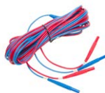
Double-wire test lead (10 / 25 A) U1/ I1 6 m / 10 m / 15 m

WAPRZ006DZBBU111 WAPRZ010DZBBU111 WAPRZ015DZBBU111