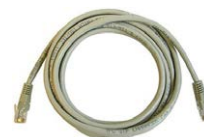
RJ45 LAN cable