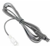
ST-3 temperature probe