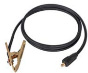
Current carrying test lead 3 m black I2 (200 A, 25 mm 2 )