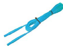
Test lead 3 m blue 1 kV U1 (banana plugs)