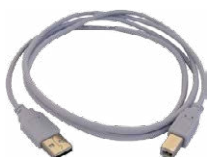
USB transmission cable