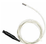
ST-1 temperature probe

WAPRZ006BUBBU2 WAPRZ010BUBBU2 WAPRZ015BUBBU2