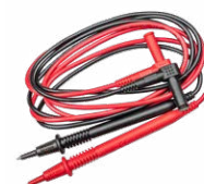
Test lead with probe for CMM/CMP (set) WAPRZCMP1