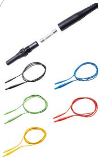
Test lead 2 m with 10 A fuse CAT IV 1000 V black / blue / green / red / yellow WAPRZ002BLBBF10 WAPRZ002BUBBF10 WAPRZ002GRBBF10 WAPRZ002REBBF10 WAPRZ002YEBBF10