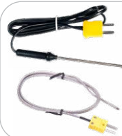
Temperature measurement probe (K-type, bayonet) WASONTEMP probe (K-type, metal) WASONTEMK2