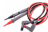
Set of test leads CAT IV, M WAPRZCMM2