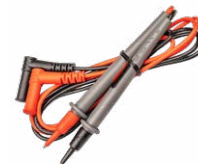
Set of test leads CAT IV, S WAPRZCMM1