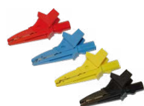
Crocodile clip red / blue / yellow / black WAKRORE20K02 WAKROBU20K02 WAKROYE20K02 WAKROBL20K01