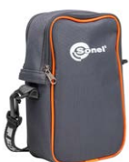
M13 carrying case WAFUTM13