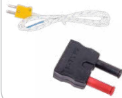
Temperature measurement Probe (K-type) WASONTEMK Adapter WAADATEMK