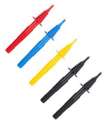
Pin probe (banana socket) red / blue / yellow / black B1 / black B3 WASONREOGB1 WASONBUOGB1 WASONYEOGB1 WASONBLOGB1 WASONBLOGB3